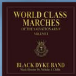
WORLD CLASS MARCHES OF THE SALVATION ARMY Black Dyke Band £13.95 CD 25022