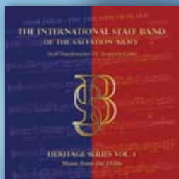
HERITAGE SERIES VOL. 1 Music from the 1930s The International Staff Band £13.95 CD 21366