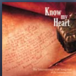
KNOW MY HEART The International Staff Songsters £13.95 CD 21385