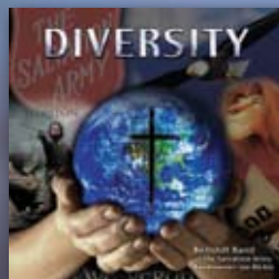
DIVERSITY Bellshill Band £13.95 CD 21383